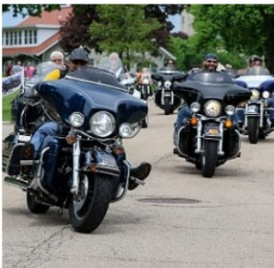
2024 BLESSING OF THE BIKES

Join us on Saturday, May 18th for a ride you'll never forget through Mooseheart's campus! Read more for details.